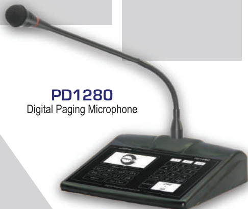
PD1280 Digital Paging Microphone